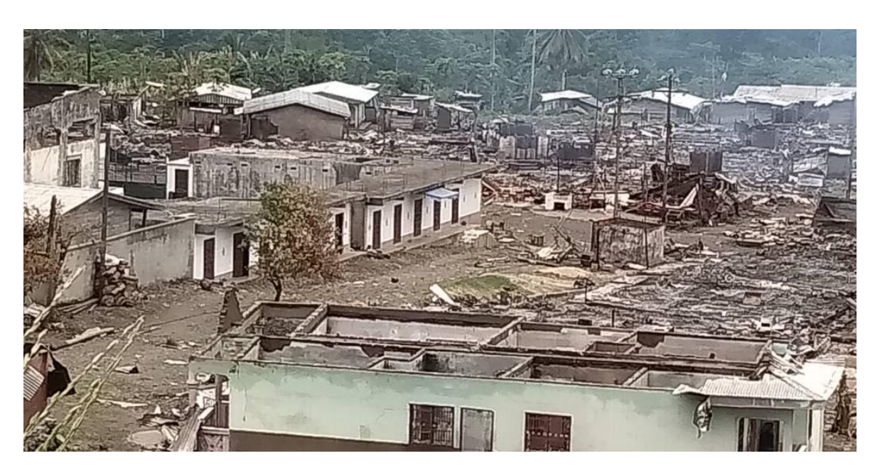
Figure 7. Burning of Munyenge.

Video footage from May 2018 of the village of Kuke Mbomo documented burning houses, the presence of ammunition, and chaos within the population. By the end of the month, many houses had been destroyed.