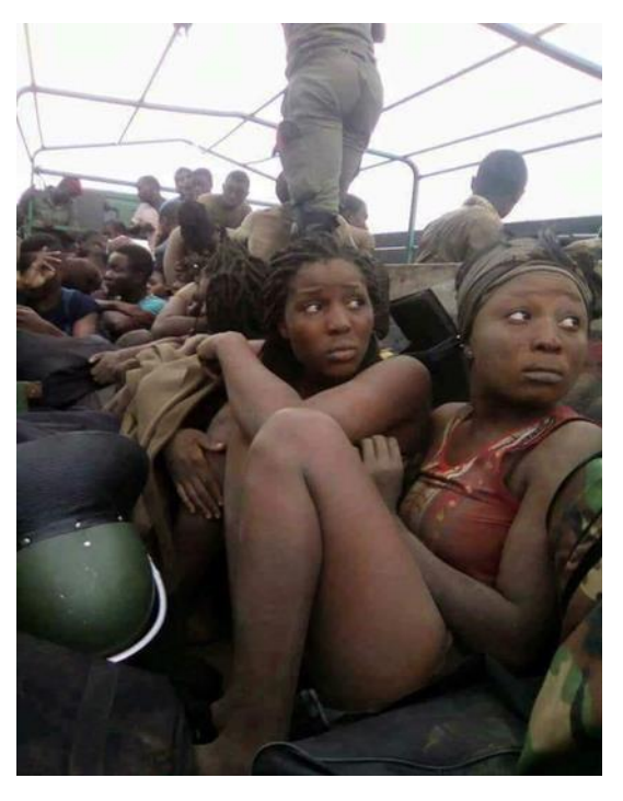
Figure 9. Students detained by military, November 2016.

land. However, the killing and arbitrary arrests of men and boys in these rural communities have left women with little to no assistance or support.