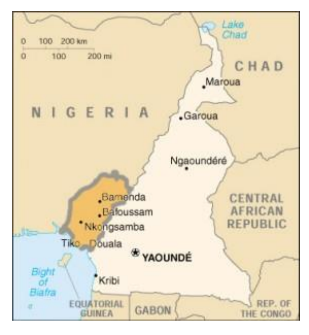
Figure 4. Cameroon.

The figures presented below are based on recent available reports from respected NGOs working in the region, research from CHRDA sources on the ground, and public sources, recognizing that the situation is evolving. Nonetheless, every effort has been made to ensure that the figures below present a reasonably accurate picture of the circumstances and the enormity of the humanitarian crisis that the conflict has caused.