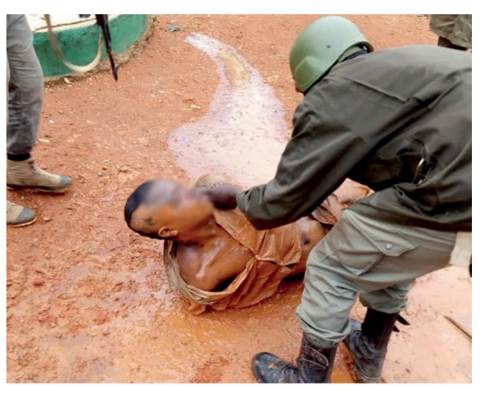
Figure 3. Cameroonian soldiers are routinely accused of mistreating civilians and suspects.

However, what started as peaceful protest by lawyers and teachers degenerated into a regional conflict that has brought suffering and fear to millions and resulted in thousands of deaths.