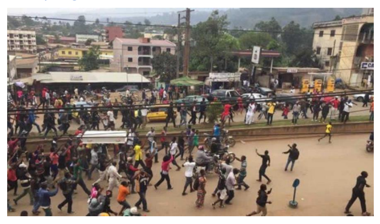
Figure 2. Demonstrations in Bamenda, 2016.

Anglophone and Francophone Cameroon were united in 1961 with promises of power-sharing and rights for the Anglophone community. However, disputes have persisted about economic and political marginalization, disregard for the regions' common law legal system, and the francization of education for Anglophones, who are a majority in the North West and South West regions of the country.